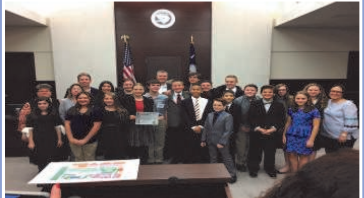
Congratulations to our Mock Trial Regional Champions who attended the state competition in Columbia.